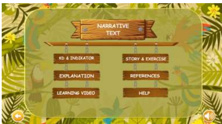
Picture 2. Media main menu display

The interactive learning media supplied the learners to master reading in intriguing way. The interactive learning media that has been develop consist of six menu namely: (1) competencies and indicator menu, (2) explanation menu, (3) learning video menu, (4) story and exercises menu, (5) references menu and (6) help menu. In term of the media, the learners needed a similar foundation in each page, and the text dimension was decipherable. Showing consistency in the media is significant. The utilization of pictures and back sounds worked on the learners' stimulation in learning English. The dissimilarity betwixt textbook and interactive learning media was the intuitiveness between the client (students) and the actual program. The intuitiveness was acknowledged by the reaction of the program from what the understudies did, whether it was correct or misplaced.