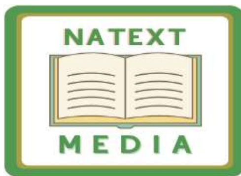
Picture 3. The Cover of media in the form application display

In this research, the resulting product still has some limitations. First, regarding the final score in the end of exercise, those misaccuracy still persist. The researcher only provides correct or incorrect answers for each question before moving on to the next question. Expectantly, the next researchers can establish the mistakes happened and or pay more awareness to the empirical matter of the media. Second, the interactive learning media can only be used in the smartphone in the form the android software. It is cannot be operated on smartphones with iOs software. Third, the product of the research only covers reading skill. The future researchers may develop interactive learning media on other skills.